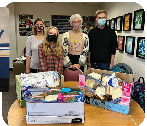
Students helped make 200+ sandwiches to be distributed by the Night Ministry bus.