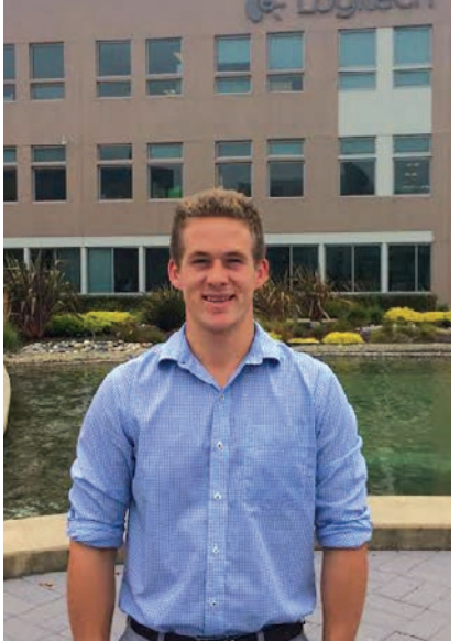
"Everyone was talking about high tech and Silicon Valley... I thought, 'I gotta try it.'"

"I'm enjoying my senior year, but I'm definitely ready for my next chapter," he said.